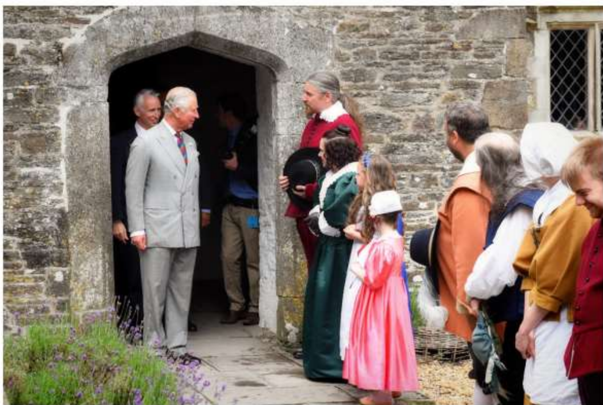
Photographs and details courtesy of Diane Walker