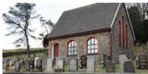
B Pentwyn near Fochriw