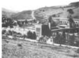
A The former Ogilvie Colliery, Deri