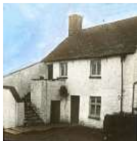
C The former Lewis School, Gelligaer