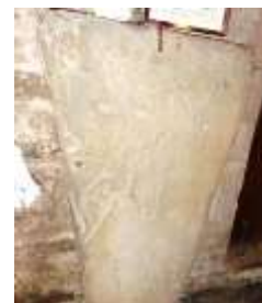
D Stone from Capel Gwladys, now in St Catwg's Gelligaer