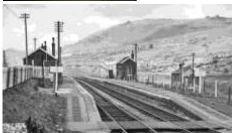
E Brithdir Station looking northwards